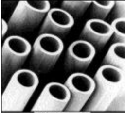
Figure - 1

Gas inFusion™ has been developed by inVentures Technologies incorporated (iTi) for dissolving gases into liquids without bubbles .