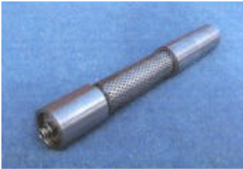
Figure - 2

Although it is primarily used to enhance natural bioremediation of hydrocarbons in groundwater using oxygen, iSOC™ can also be used to infuse any gas into groundwater, including gases used to enhance natural degradation of chlorinated solvents.