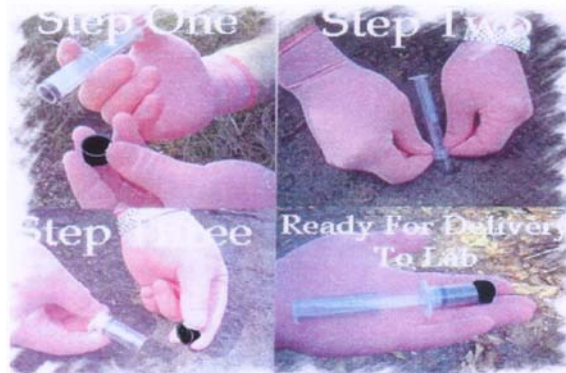
The 5035SC™ Sampler collecting a soil sample.

The 5035SC™ Samplers are used to reduce volatilization of VOCs and SVOCs. The 5035SC™ Sampler is designed to meet the requirements for the EPA 5035 method. It is approved by the RWQCB Region 1 for hydrocarbon sampling and transportation (using dry ice) and by the EPA and DTSC for sampling and field preservation (using sodium bisulfite or methanol). 5035SC™ Samplers cost $199 for a bag of 50 with a free PVC handle and free overnight shipping. Each 5035SC™ Sampler comes with a hermetically sealed inert plastic bag with laboratory label attached